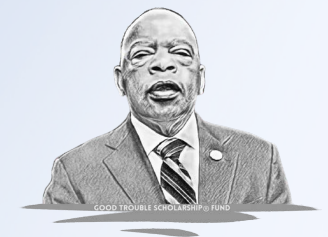
Good Trouble Scholarship Fund