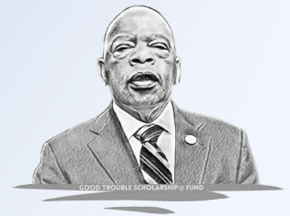
Good Trouble Scholarship Fund